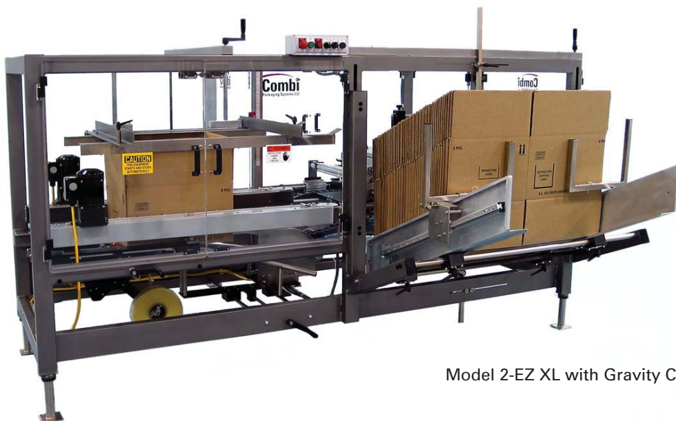
Model 2-EZ XL with Gravity Case Magazine