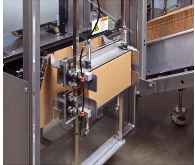
Combi tray erectors are an ideal solution for slotted style trays

An operator loads flat tray blanks into the gravity magazine. A vacuum arm extends to the tray blank, applies suction, retracts and then moves the flat tray horizontally past two glue heads which apply a glue bead to the tray tabs. The glue application is controlled by magnetic position sensors which sense the tray position. After passing the glue heads, the transport arm extends and pushes the flat tray blank into a mandrel, forming the tray and folding the tabs. At this moment, four small cylinders extend into the mandrel, one at each corner of the newly formed tray, applying pressure and securing the glue seal. The vacuum arm then retracts and returns to the home position to pull another blank.