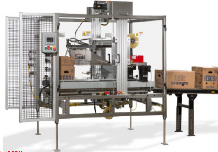
TBS-100RH Random Height Case Sealer