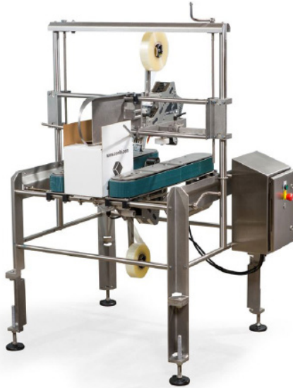
TBS-100 SA SEMI-AUTOMATIC Sanitary Top & Bottom Case Sealer w/ leg extensions